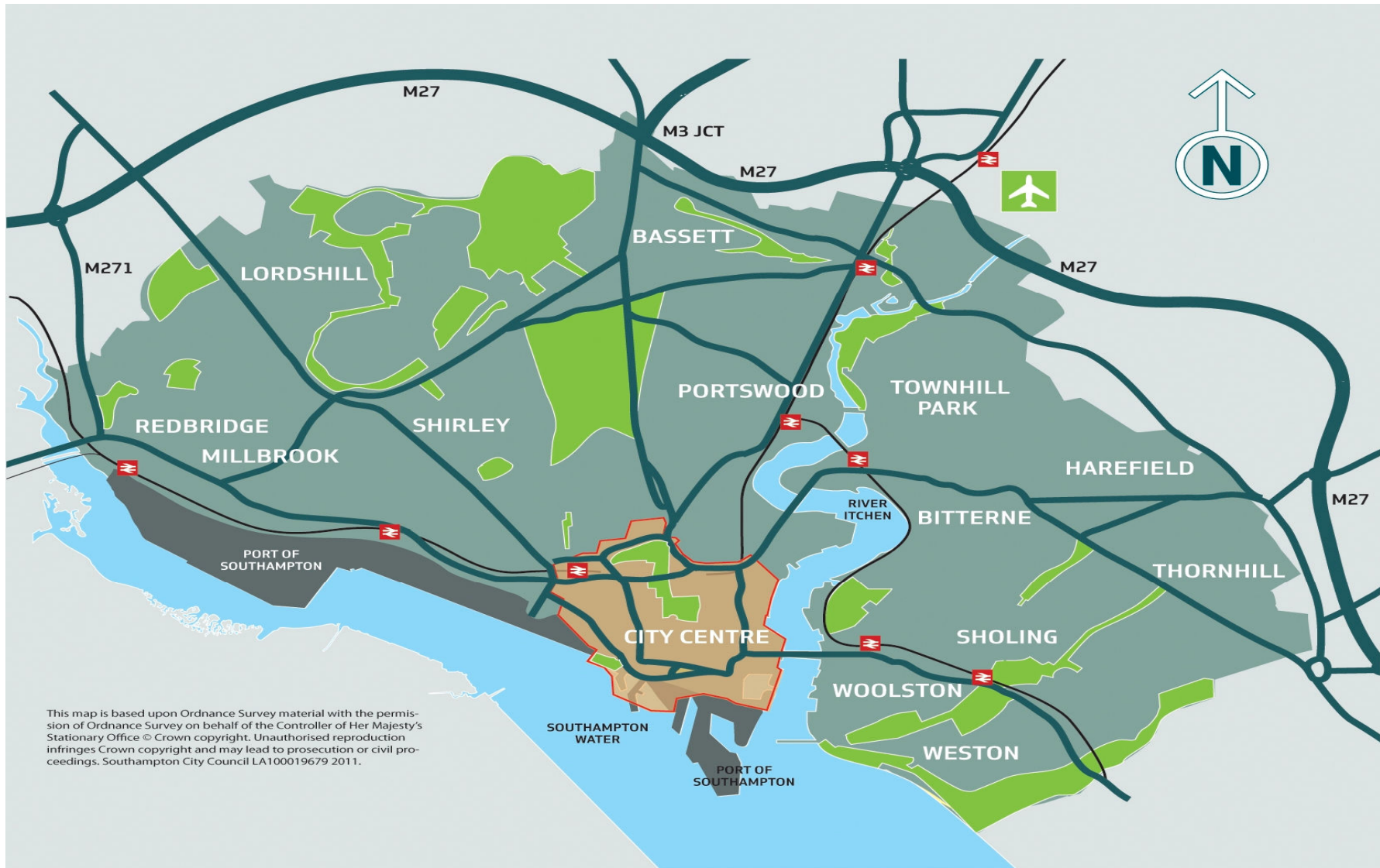
Map 1 The administrative boundary of the city and the extent of the city centre